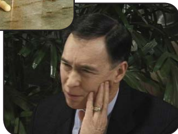
Call if discomfort continues